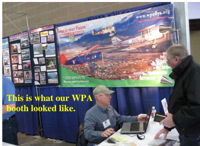
This is what our WPA booth looked like.