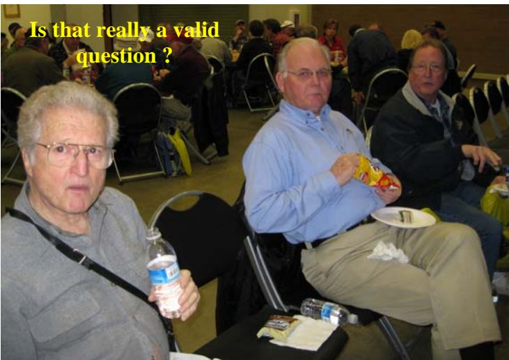
Is that really a valid question ?