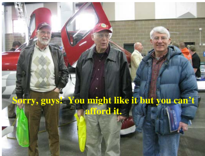
Sorry, guys! You might like it but you can't afford it.