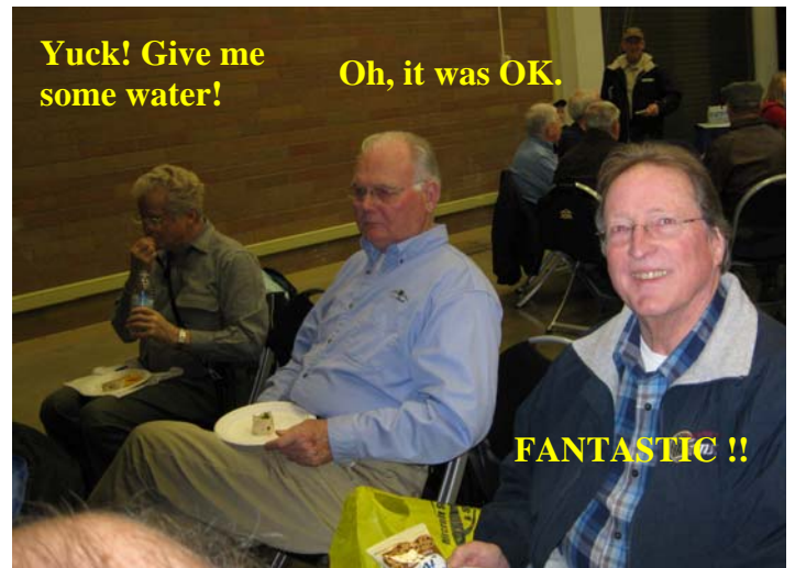
Yuck! Give me some water!