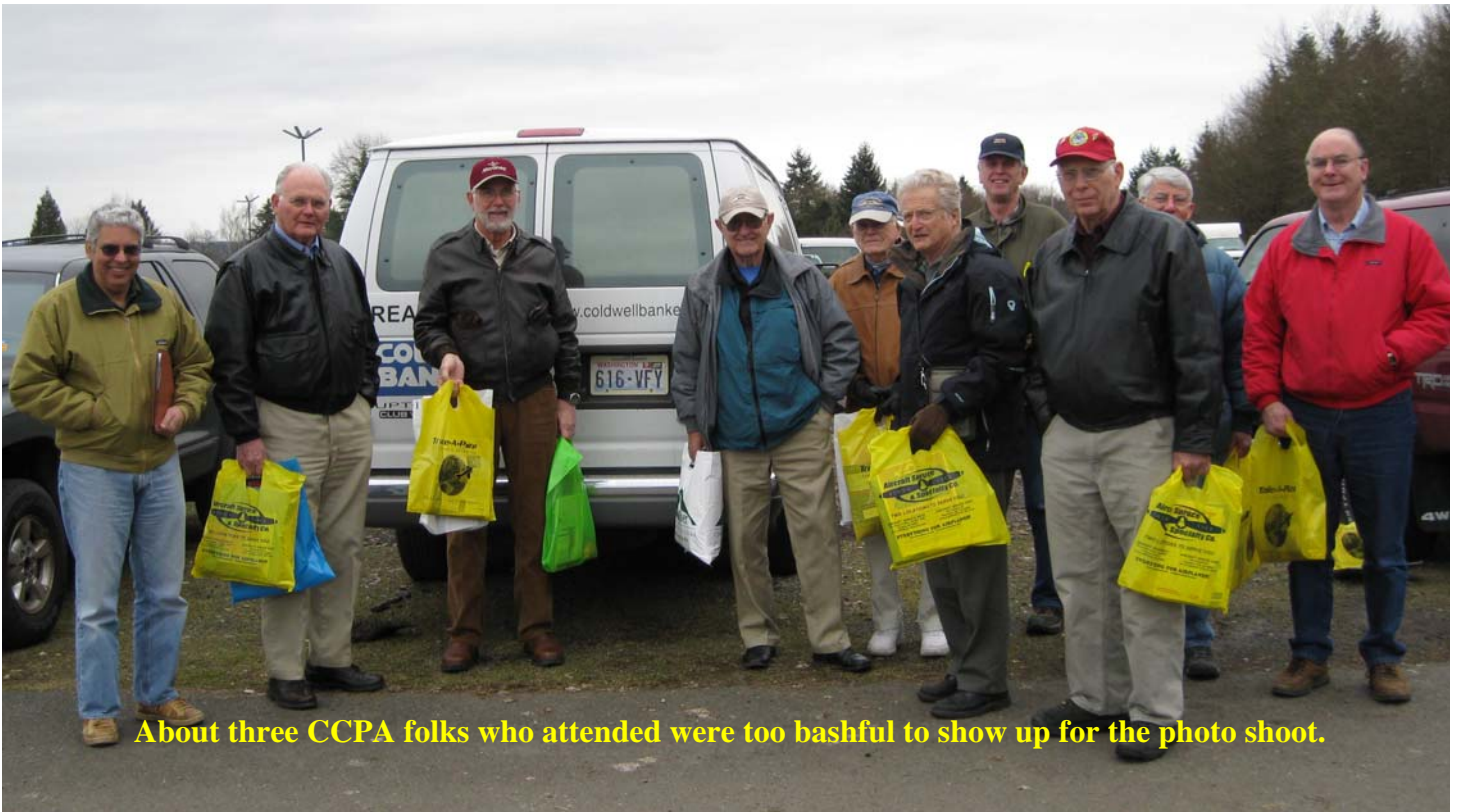
About three CCPA folks who attended were too bashful to show up for the photo shoot.