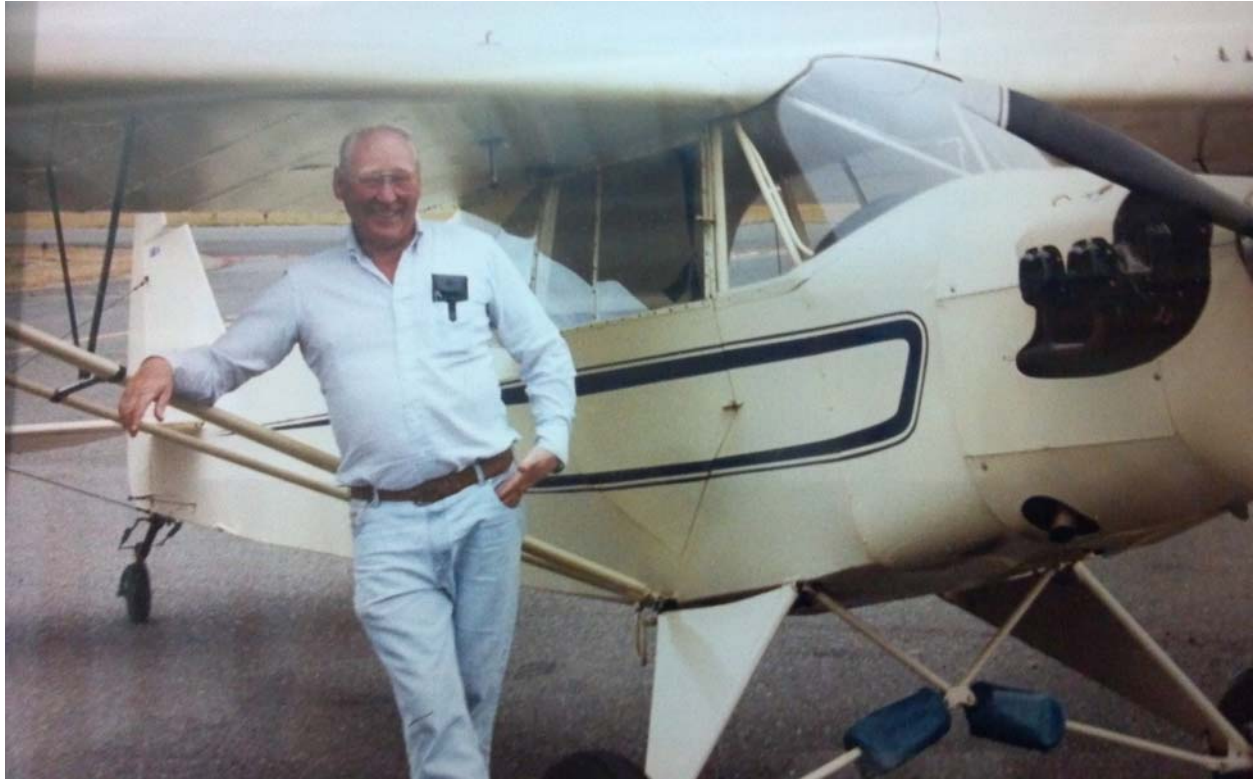
August 7, 1933—October 15, 2011