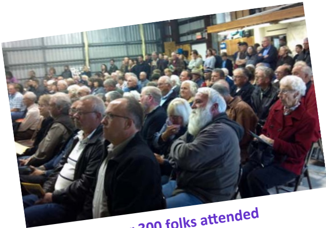
Over 300 folks attended