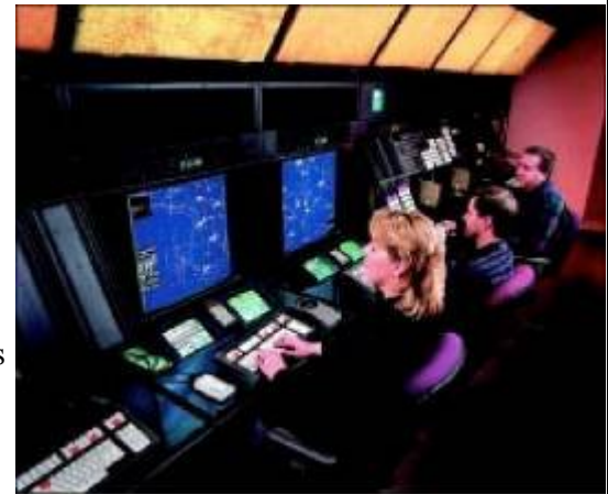
Center radar displays.

Four WPA pilots, and one guest, made the trip to Auburn to tour Seattle Air Route Traffic Control Center (Seattle ARTCC, Seattle Center, or, by its designator, ZSE), on Friday, July 10. Seattle Center is the high altitude air traffic control center for all of Washington, most of Oregon, and parts of western Montana, northern Idaho, and extreme northern California. ZSE also handles air traffic down to the surface outside and between those areas handled by local approach controls such Chinook, Seattle, Spokane and Portland approaches. Seattle Center handles the traffic at and above 11,000 feet above Chinook Approach’s airspace.